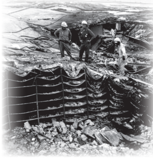
Workers examine the destruction at the National Personnel Records Center in 1973.

The WWII Separation Notice Team at the Library of Virginia Access to the records will be limited during the digitization phase of the project. Interested users are encouraged to contact Archives Reference for more information.